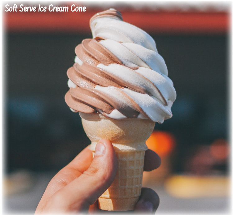
Soft Serve Ice Cream Cone