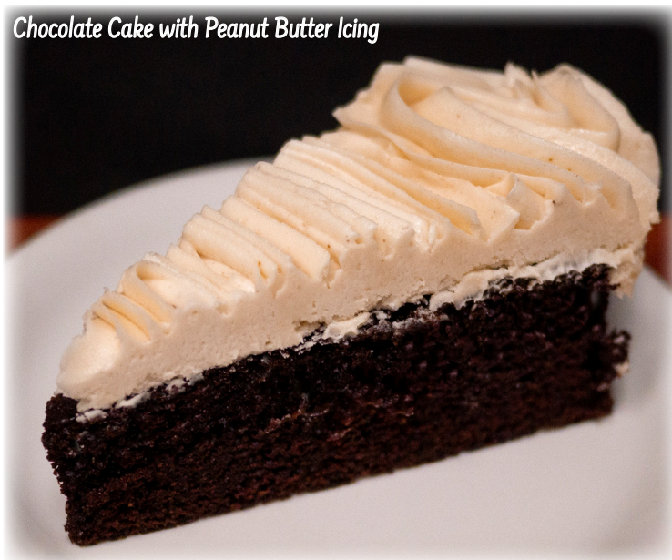
Chocolate Cake with Peanut Butter Icing

CONSUMING RAW OR UNCOOKED EGGS OR MEAT MAY INCREASE YOUR RISK OF FOODBORNE ILLNESS, ESPECIALLY IF YOU HAVE CERTAIN MEDICAL CONDITIONS.