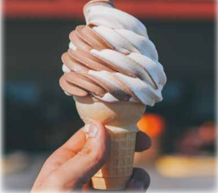
Soft Serve Ice Cream Cone