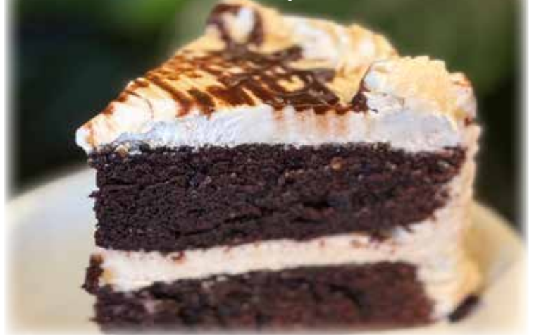
Chocolate Cake with Peanut Butter Icing

ASK YOUR SERVER ABOUT THIS MONTH'S HOMEMADE DESSERT FEATURES