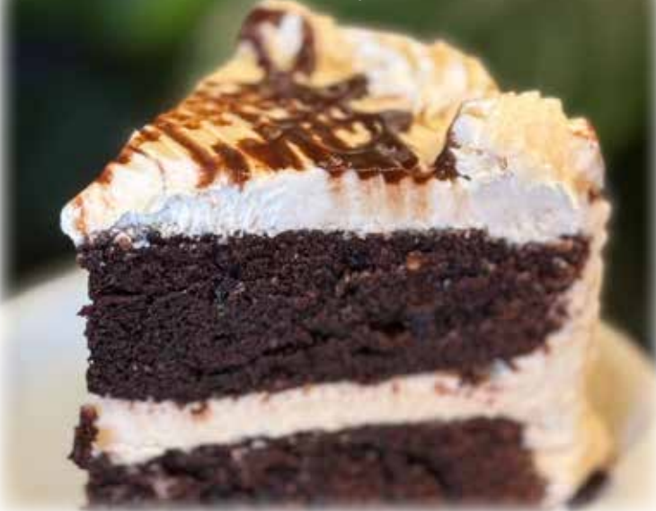
Chocolate Cake with Peanut Butter Icing

Apple, Orange, Cranberry, Tomato or Grapefruit