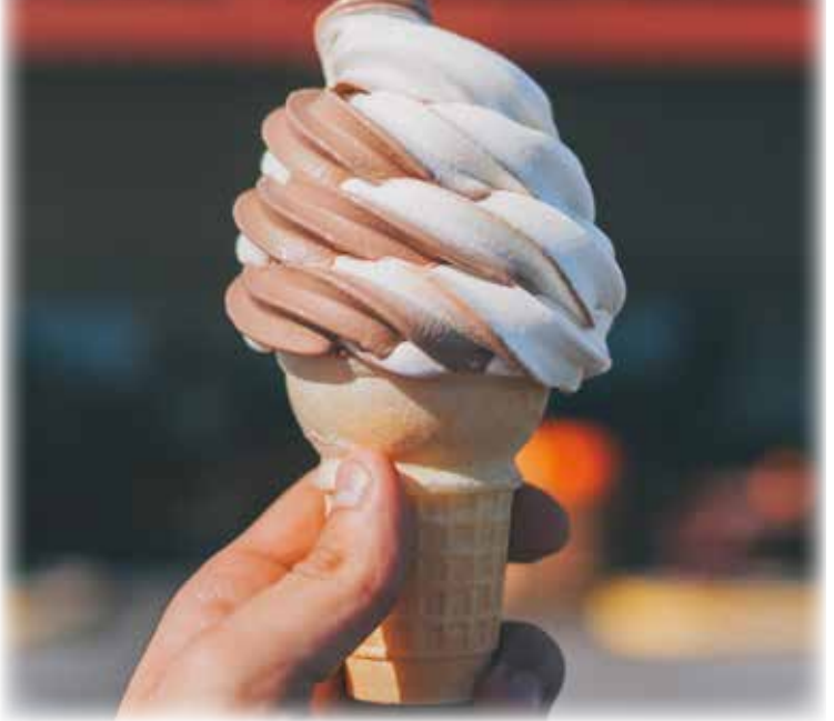
Soft Serve Ice Cream Cone